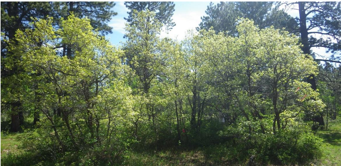
Photo (above) depicting a common Gambel oak patch surrounded by ponderosa pine in the La Fair treatment unit in the northern Uncompahgre Plateau, CO.

Thus, treatments aimed at reducing Gambel oak may or may not actually improve wildlife browse potential. Although some information on understory vegetation response to Gambel oak treatments exists, much of this research was developed for the Southwestern U.S., and may not reflect the unique environmental conditions on the Uncompahgre Plateau nor the conditions of the northern extent of Gambel oak's range in Colorado. At the northern extent of its range in the Uncompahgre Plateau and Front Range Mountains, Gambel oak often grows as a low shrub, whereas in the southern extent of its range, the oak may grow as tall shrubs or large mature trees. Due to this variability, it is unclear whether information and research on Gambel oak from the Southwestern U.S. applies to the northern extent of its range in Colorado. Locally-relevant information on Gambel oak management is greatly needed to understand understory vegetation response to cutting and prescribed burning treatments in this species.